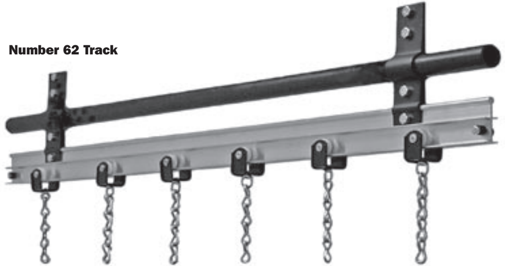
Number 62 Track